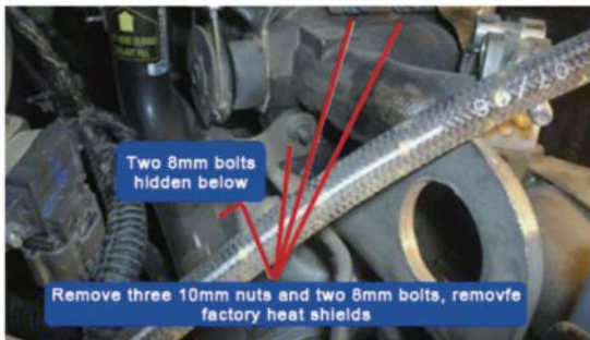
Step 11: Two 8mm bolts hidden below. Remove three 10mm nuts and two 8mm bolts, remove factory heat shields.