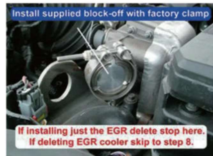
Step 10: If installing just the EGR delete stop here. If deleting EGR cooler skips to Step 8.