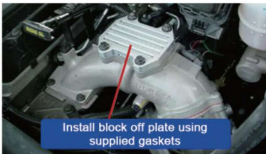
Step 9: Install block off plate using supplied gaskets.