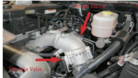
Step 8: The throttle valve is located on the driver side, just under the intake elbow. Remove the throttle body and install it with a new throttle valve pipe, bolts, and gasket. It is important to leave this unplugged in order to keep the throttle valve from permanently closing.